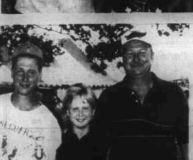
Go-Texan Photographs Courtesy of Pam & Henry Potter